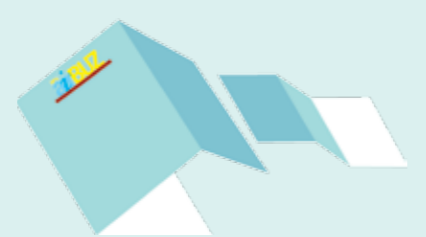
▶ Gatefold Cover