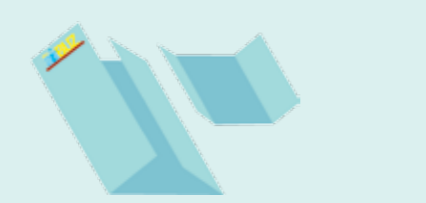
▶ Barn Door Cover